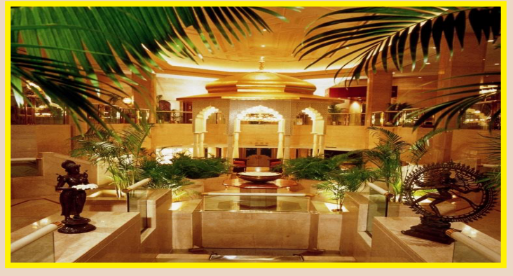
Lobby at The Leela Mumbai